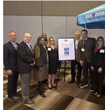
Photo Caption: Senate Majority Leader Andrea Stewart-Cousins with NYSSCPA Leaders at the Annual Business Council's Legislators Reception