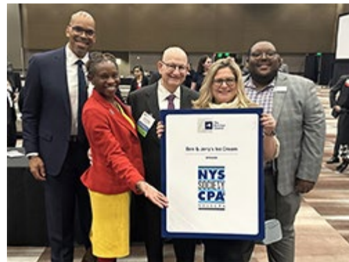
NYSSCPA Leadership at the Annual BCNYS Legislator's Reception in Albany