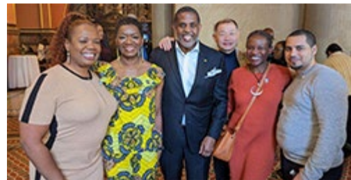
NYSSCPA at the New York State Association of Black, Puerto Rican, Hispanic & Asian NYSSCPA Leadership at the Annual BCNYS Legislator's Reception in Albany